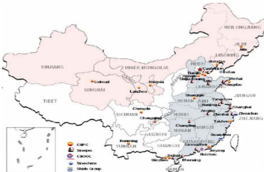
Map: Major Refinery Expansion Projects in China for 2010 and Beyond